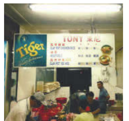
Tony Claypot Chicken Rice.