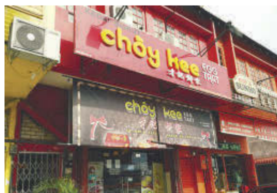
Choy Kee Egg Tart.