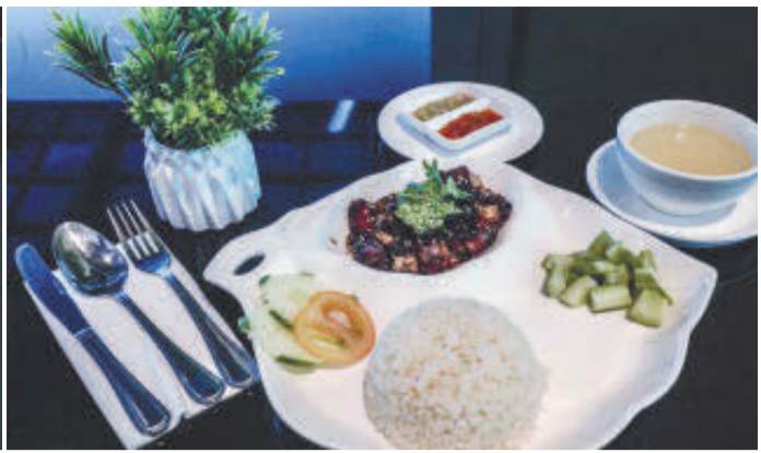
At The Cuisines... (from far left) fish n' chips; Ipoh chicken rice and halal BBQ chicken are signature dishes at the resort.

There are indoor and outdoor facilities where guests can play ball games such as tennis, basketball, squash, badminton and table tennis. Over the weekends, they can also try their hand at paintball and archery as well.