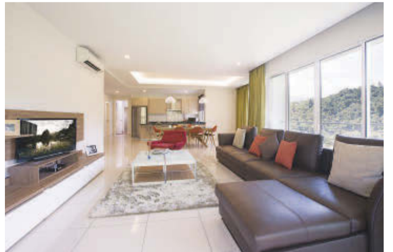
The spacious family suite. – THE HAVEN

For selfie lovers, the hotel has convenient signage to mark out Instagram-worthy spots. There are even special smartphone stands to help guests get the best