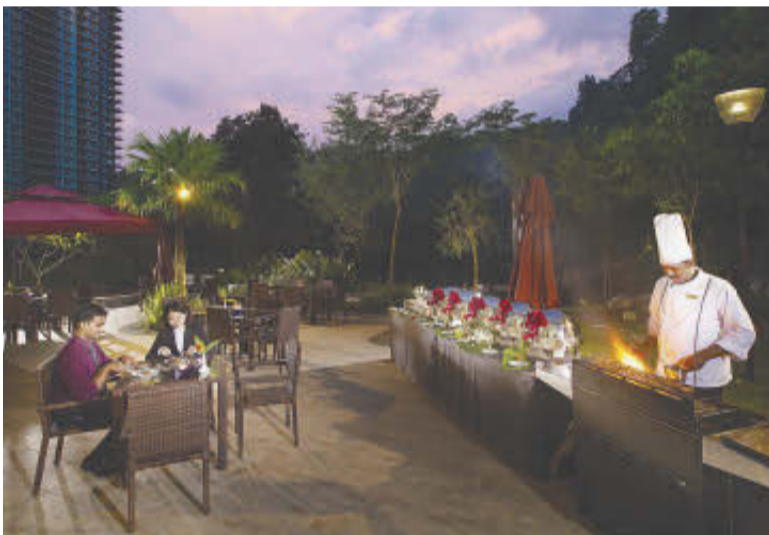
Enjoy a poolside dinner under the stars. – THE HAVEN

MENTION Ipoh and food inevitably comes into the conversation. Well known as a foodie heaven, those visiting Ipoh will already have done their research on what and where to eat so we will not be doing that ... instead, we will focus on some of the most popular and delicious foods out-of-townners pack when they leave Ipoh.