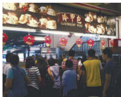
Langkap Pau @ Golden Point Food Court.