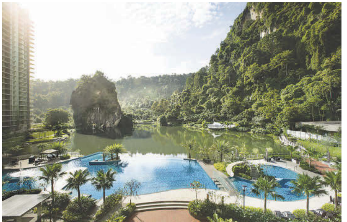
(above, and right) The relaxing resort ambiance of The Haven.